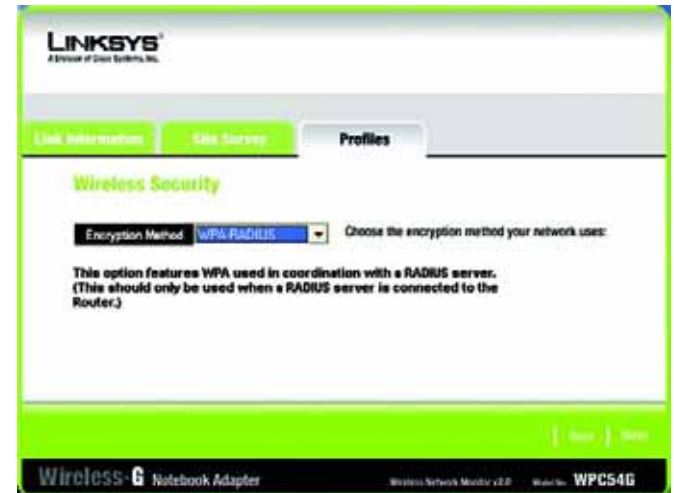
Figure 6-17: WPA RADIUS Settings

Click Next to continue or Back to return to the previous screen.